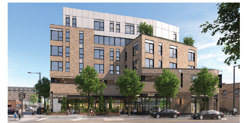
Rendering of 4715 N Western

Mayor Brandon Johnson opened the groundbreaking at Fifth City Commons, a new-construction affordable housing development by POAH located in the East Garfield Park neighborhood near the Kedzie/Lake Green Line. It includes 43 apartments built to Passive House standards. The development sits at the gateway to a part of Garfield Park called "Fifth City" and was named through a community-driven process co-led by Elevated Chicago Steering Committee org Garfield Park Community Council. The name also honors a community organization active in the neighborhood starting in the 1960s whose message and legacy still resonate today. Elevated supported this ETOD with a 2022 pre-development grant.