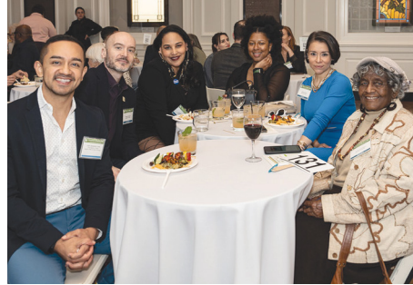
Attending the Active Trans' Movers and Shakers Ball