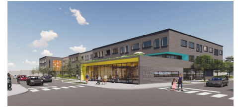
Rendering of Fifth City Commons

Elevated Chicago and IHS supported two case studies on vacant lots near transit in the Roseland/Washington Heights and East Garfield Park neighborhoods. Research showed that there are more than 11,000 vacant lots located near transit in predominantly Black communities (about 3,400 are City-owned). The work entailed engagement with residents on their current perceptions of and future aspirations for vacant land. Walking tours were held in both communities to highlight vacant lot history, current conditions and potential development.