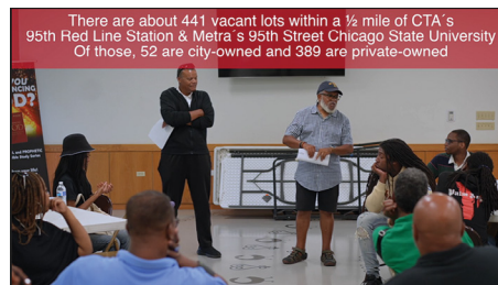
Community meeting near the 95th/Dan Ryan Red Line station