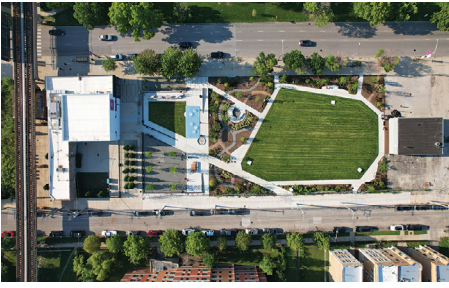
Aerial view of the new Arts Lawn

Little Village community. Elevated Chicago was one of the first supporters of this project, providing a $125,000 grant and technical assistance since 2018.