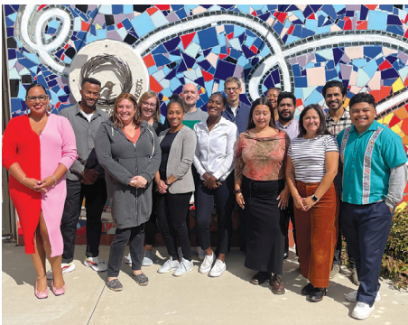
Connected Communities Impact Table members in front of mosaic at The Hatchery

Elevated Chicago hosted breakfasts with aldermen to discuss the importance of ETOD, propose a plan for an office of ETOD in Chicago, and share why ETOD principles need strong government backing to be successful. Additionally, Steering Committee members and partners met with City Council and their staff to engage them in next steps needed to sustain the city's growing ETOD pipeline. A total of 26 aldermanic offices were engaged.