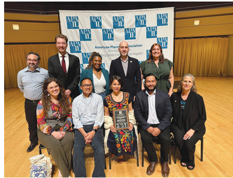
Receiving the Advancing Diversity and Social Change Award