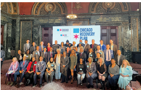
ETOD grantees at the City of Chicago's May 2023 announcement