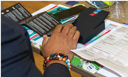
In.Field Community Engagement Toolkit

Elevated Works, an initiative of Elevated Chicago managed by the Center for Neighborhood Technology, IFF, Metropolitan Planning Council (MPC) and Rudd Resources, launched in the spring. It engages 18 organizations as technical assistance providers for ETOD projects that received funding from the Chicago Dept. of Planning and Development. The Chicago Community Trust, MacArthur Foundation and JPMorgan Foundation are co-funding this effort.