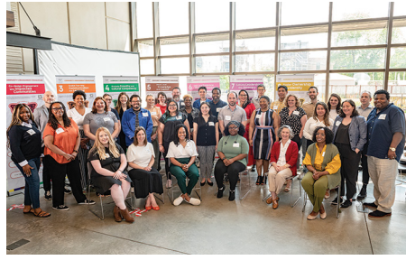
Elevated Works technical assistance launch

As part of the National Equitable Recovery Alliance, Elevated Chicago joined ACT-LA (Los Angeles) and the TransFormation Alliance (Atlanta) to launch the Connected Communities Impact Table. Funded by the Robert Wood Johnson Foundation, this collaborative builds on the work the three organizations undertook from 2017 to 2022 with funding from SPARCC (the Strong, Prosperous And Resilient Communities Challenge), a national equity initiative. This new Impact Table focuses on ETOD and