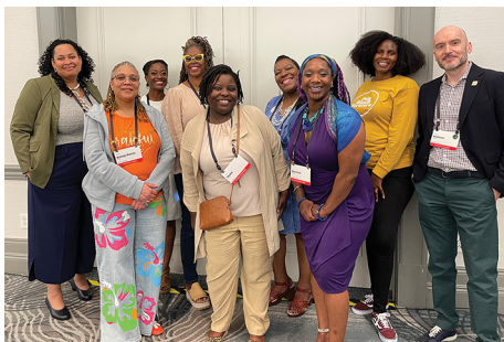
Catalyze Conference speakers in St. Louis