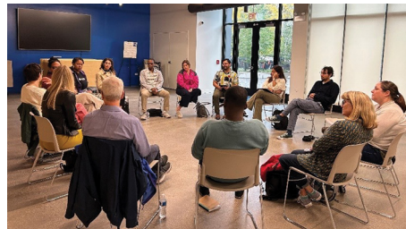
Convergence Partnership meeting in Logan Square

Coalition partner Chicago Metropolitan Agency for Planning (CMAP) and Steering Committee member Palenque LSNA received the Advancing Diversity and Social Change Award from the American Planning Association Illinois Chapter for their work on the Logan Square Blue Line ETOD Action Plan , supported by Elevated Chicago.