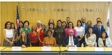
Sept. 7, 2023 USDOT Chicago Listening Session

The Connected Communities Impact Table, part of NERA and co-led by Elevated Chicago, Transformation Alliance (Atlanta), and ACT-LA, convened in Chicago for a day-and-a-half session. The meeting served as a learning exchange and strategizing session for furthering the goals of the table: resourcing organizations to do ETOD work, providing joint oversight and community engagement for ETOD, and educating partners about public policy and impact at the federal level. Organizers from the three cities attended the event and toured The Hatchery, one of Chicago's pioneering ETODs.