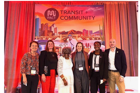
"A Decade of ETOD" presenters

Elevated Chicago and The Chicago Community Trust hosted a two-day meeting of the Convergence Partnership, a collaborative of national and community foundations advancing racial and health equity. Members discussed how to organize philanthropy to amplify community power and multiyear regional investment strategies. The group received a tour of the Logan Square eHub led by Palenque LSNA.