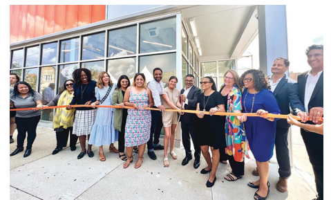
Ribbon cutting at Latinos Progresando Community Center

4715 N Western, a development by The Community Builders near the Western Brown Line station, broke ground. There will be a total of 65 new affordable homes, ground-floor commercial space, and expanded outdoor public space.