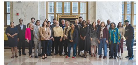
Members of the mayoral transition Subcommittee on Transportation

The Chicago Community Trust was honored by the Council on Foundations and US Department of Housing and Urban Development Secretary's Award for Public-Philanthropic Partnerships. This award acknowledges the leadership and contributions the Trust has made in Elevated Chicago and its close collaboration with the Mayor's Office, City departments, Chicago Transit Authority and other government partners.