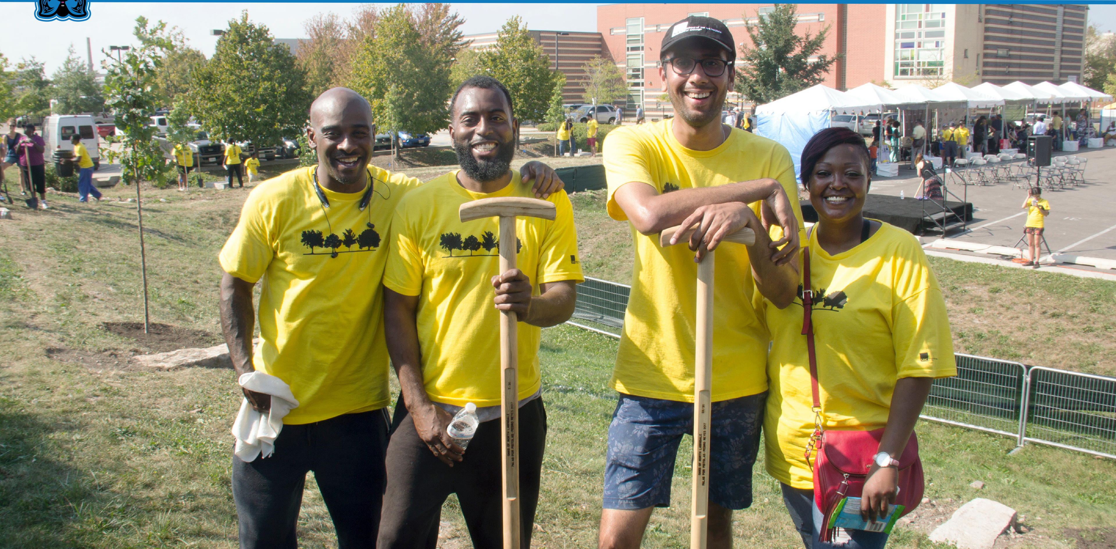
Photo: Guns were smelted into shovels for planting trees as part of the reforestation effort Oaks of North Lawndale, led by the School of the Art Institute in Homan Square.