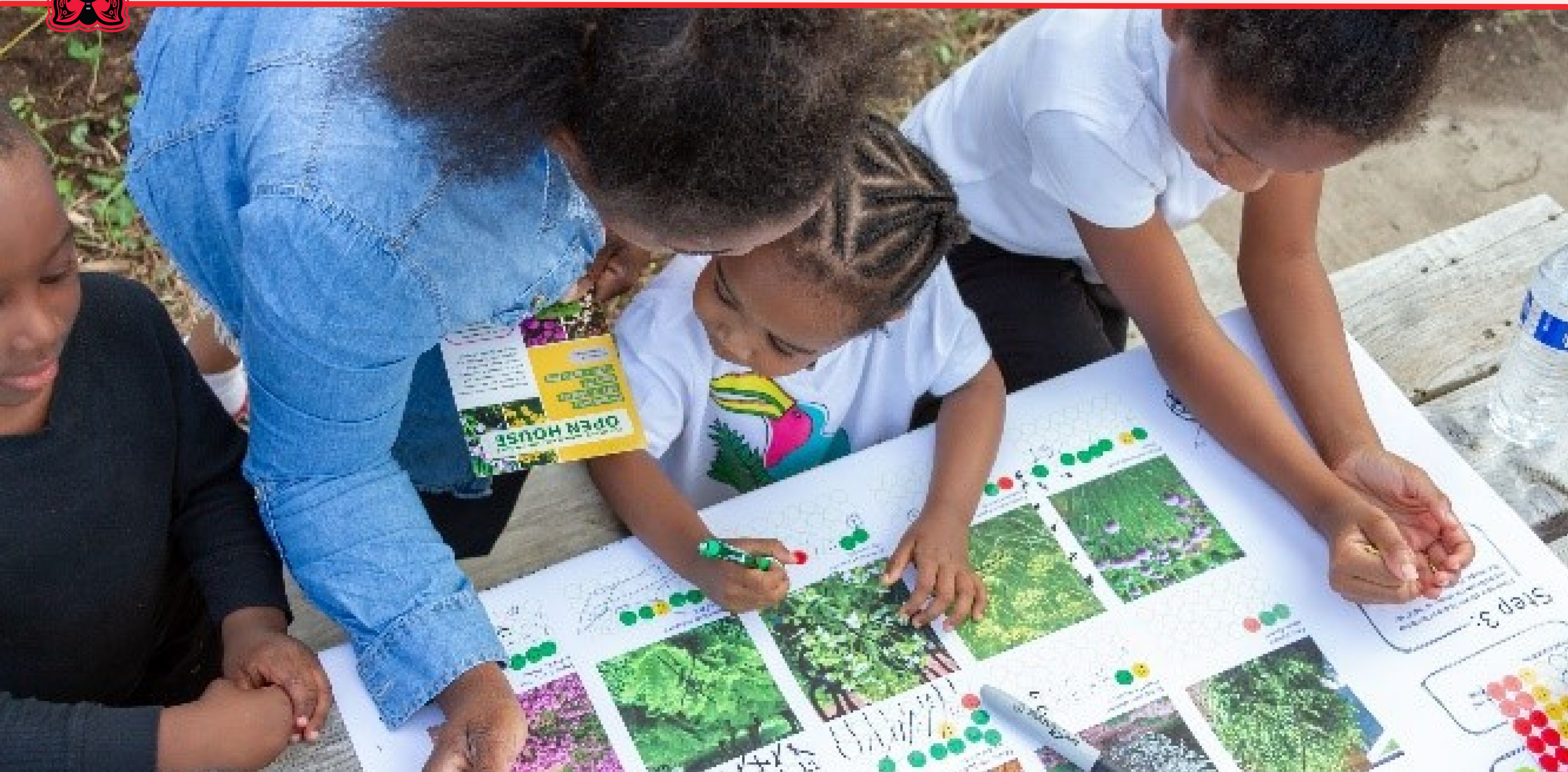
Photo: Designing a rain garden and shade sculpture near transit with community residents convened by the Garfield Park Community Council