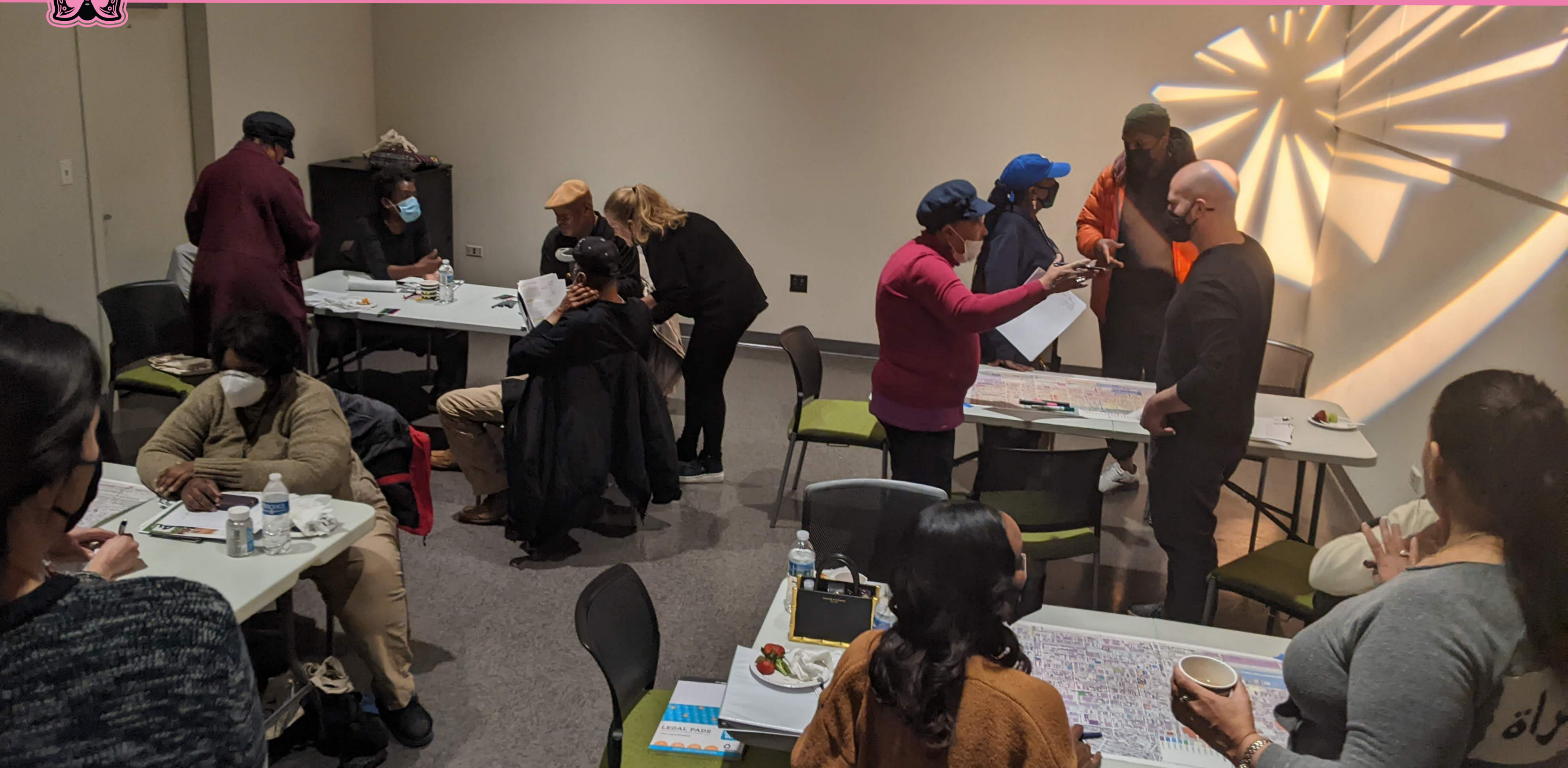
Photo: Community-driven ETOD action planning for the Garfield station area co-led by the Chicago Metropolitan Agency for Planning and the Green Line South Community Table.