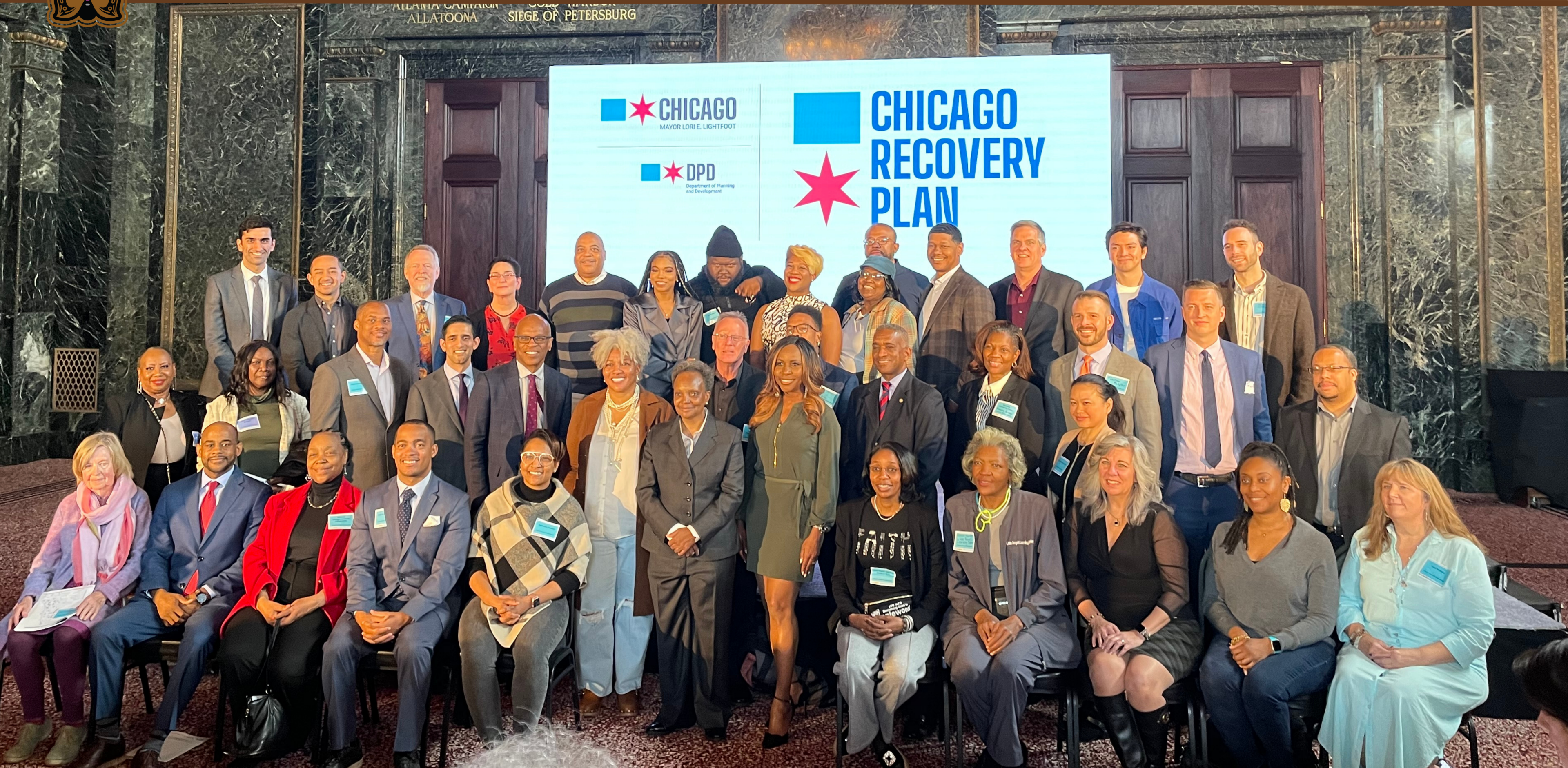
Photo: Community organizations, small businesses and developers receive equitable transit-oriented development (ETOD) grants to support localized community and economic development efforts.