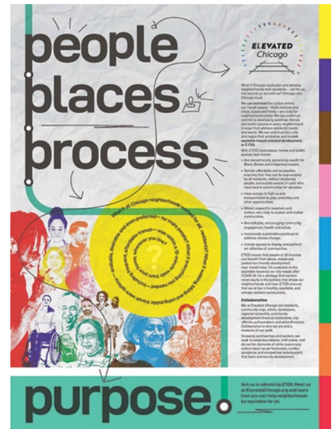
2022-2024 Elevated Chicago workplan poster

Our Steering Committee enthusiastically approved our 2022-2024 workplan, which outlines our priorities for the next three years. Designed as a foldable, portable reference for understanding, advocating for, and celebrating equitable development, the workplan will be publicly available in January 2022. It was created with and for Elevated Chicago by Foresight Design Initiative, JNJ Design and Rudd Resources.