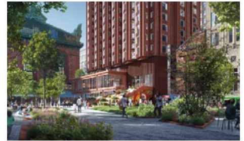
Assemble Chicago, affordable ETOD housing for essential workers