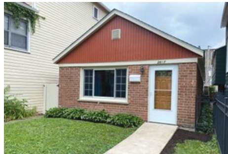
Here to Stay Land Trust's home in Logan Square