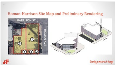
Homan-Harrison Mixed-Use Development Project is one of 11 sites supported by a pilot program to advance the city's new ETOD policy.